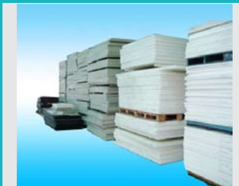
Uncut Extruded Plate (thick)