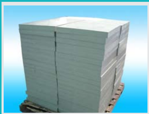
Cut Extruded Plate (thick)

Founded in 2002, we are an integrated maker of engineering plastic products including HDPE/PP plates/bars and POM bars. We have set up a recycling division to reuse materials to effectively cut cost, enhance efficiency, and quality. Also we help buyers develop new products, handle plastics processing, and fill custom orders to meet customer satisfaction.