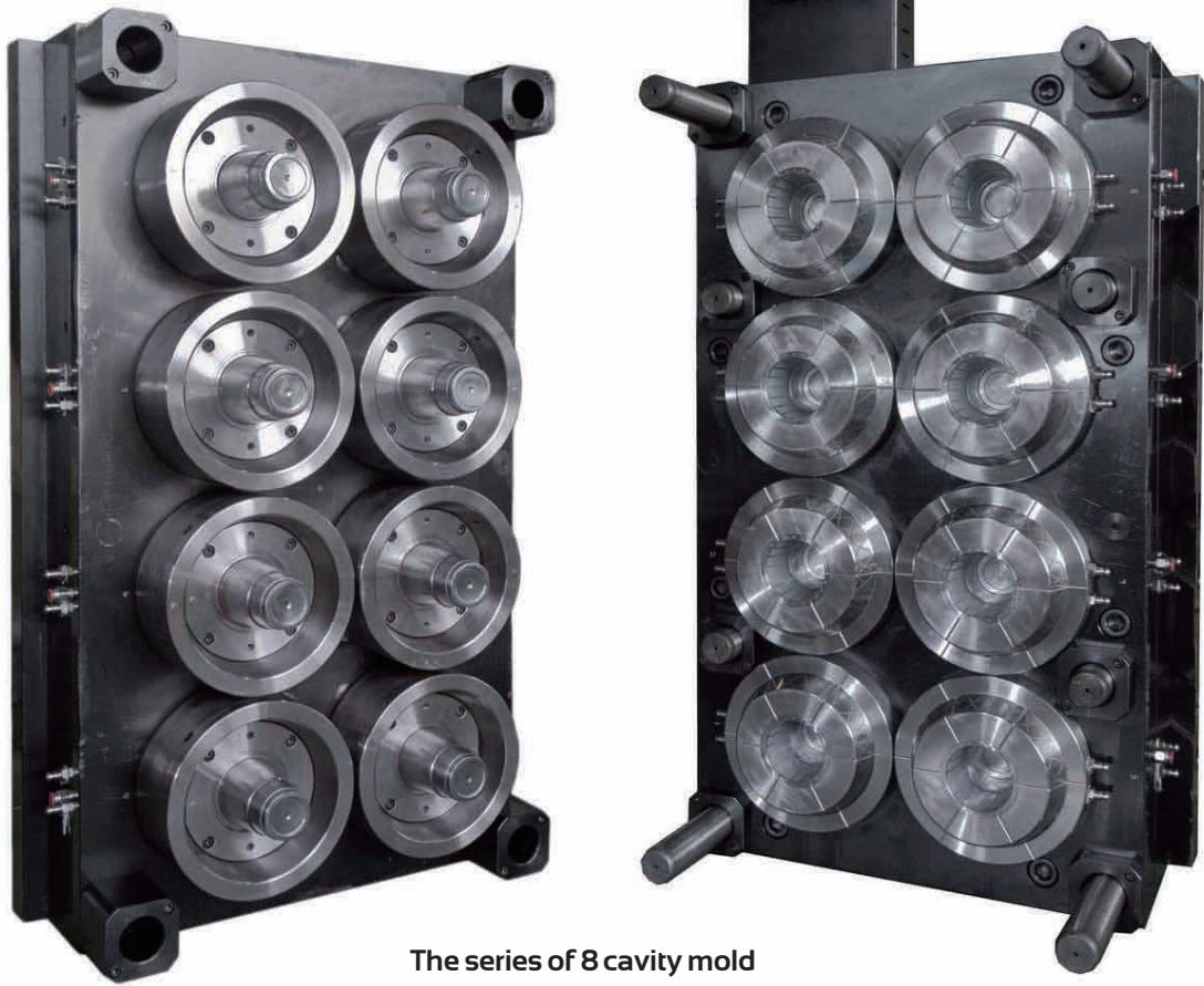
The series of 8 cavity mold