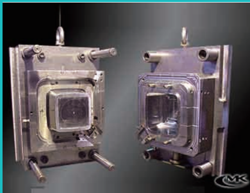
In-mold Labeling Mold