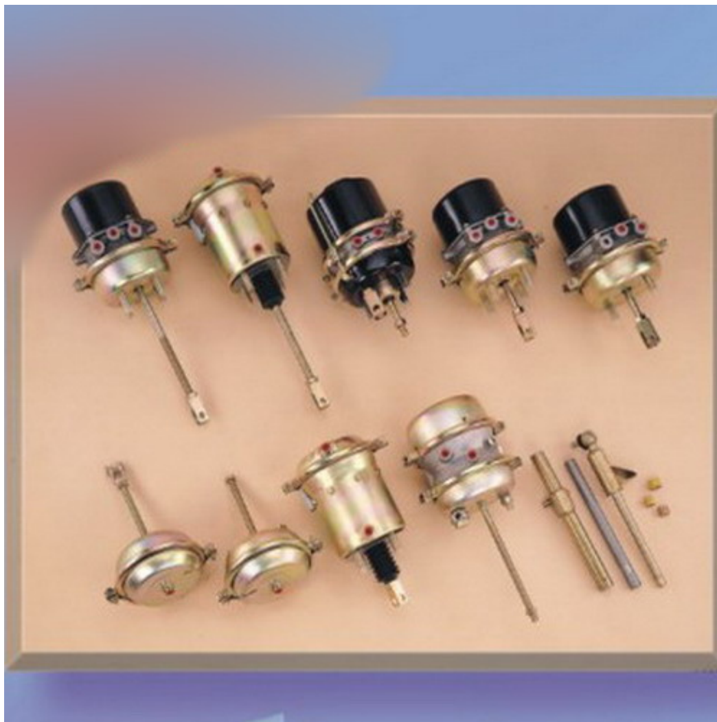
Air Chamber Parts For Brake System