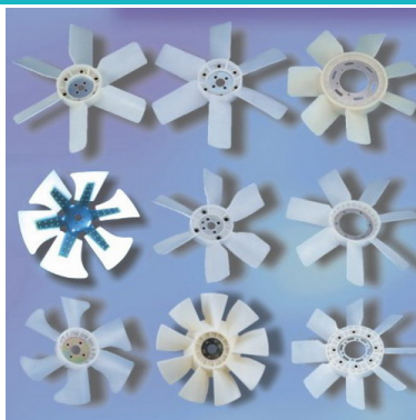
Fans For Autos, Generators, And Liters.