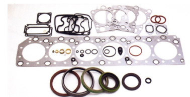
Hydraulic Cylinder Seal Sets for Heavy-duty Vehicles