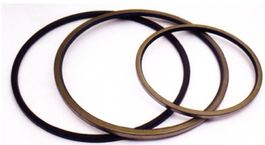
UV-proof Oil Seals for Windmills (max. 1,200mm ID)

ROLLING SPRING CO., LTD. is dedicated in Piston Ring, Oil Seal, Liner, Cylinder Head Gasket Set, Brake/Clutch Master Cylinder, Piston with operations in Taiwan.