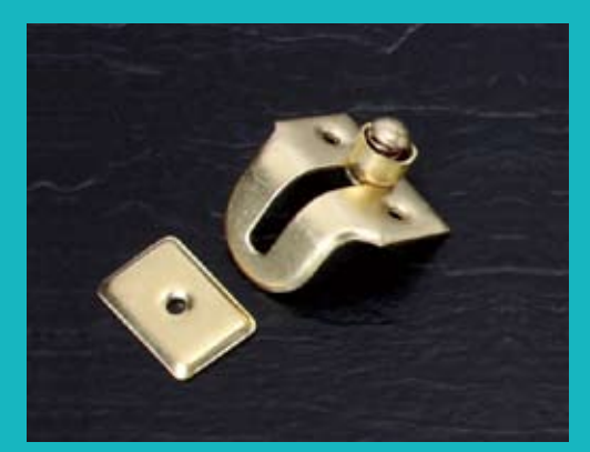
Barrel Bolt Ventilating Window Lock