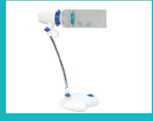
NEW HUKU LED Tablet Bulb+ table stand