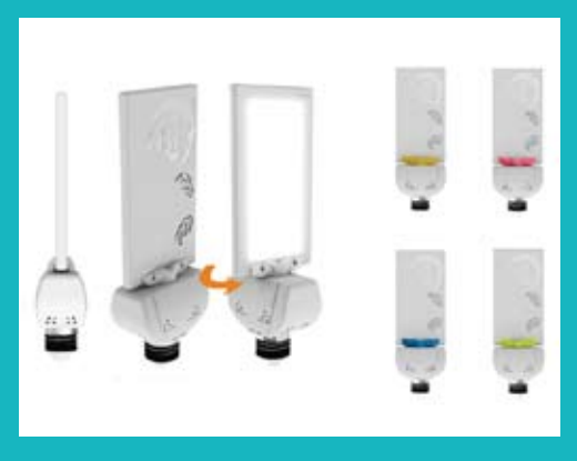
NEW HUKU LED Tablet Bulb