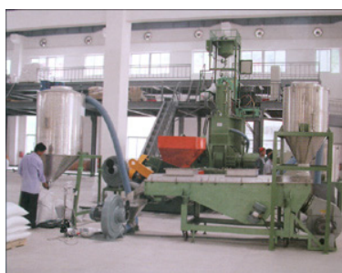
PVC Pellet Making Equipment