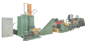
PR-Type Pellet Making Equipment

Jin Kuo Hua has been established for forty years, and specializes in manufacture of PVC soft and hard tube and other related machines including pressor 30mm-150mm, PR plastic grain machine, PVC hard & soft tube machine, PVC roofing board machine, and all series of various machines. Our strength of manufacture includes automatic production line f... [more]