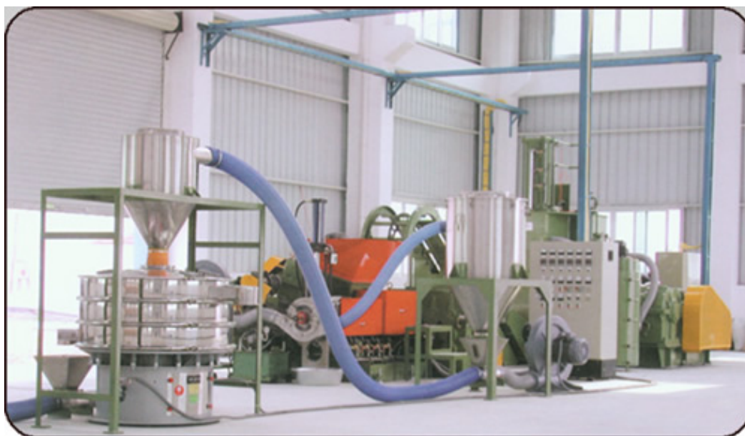
PR-Type Pellet Making Equipment