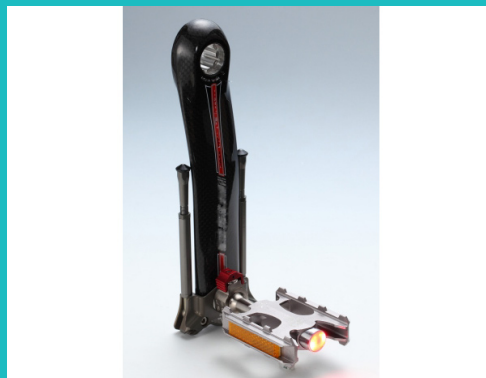
CoolStand (Just pictures)