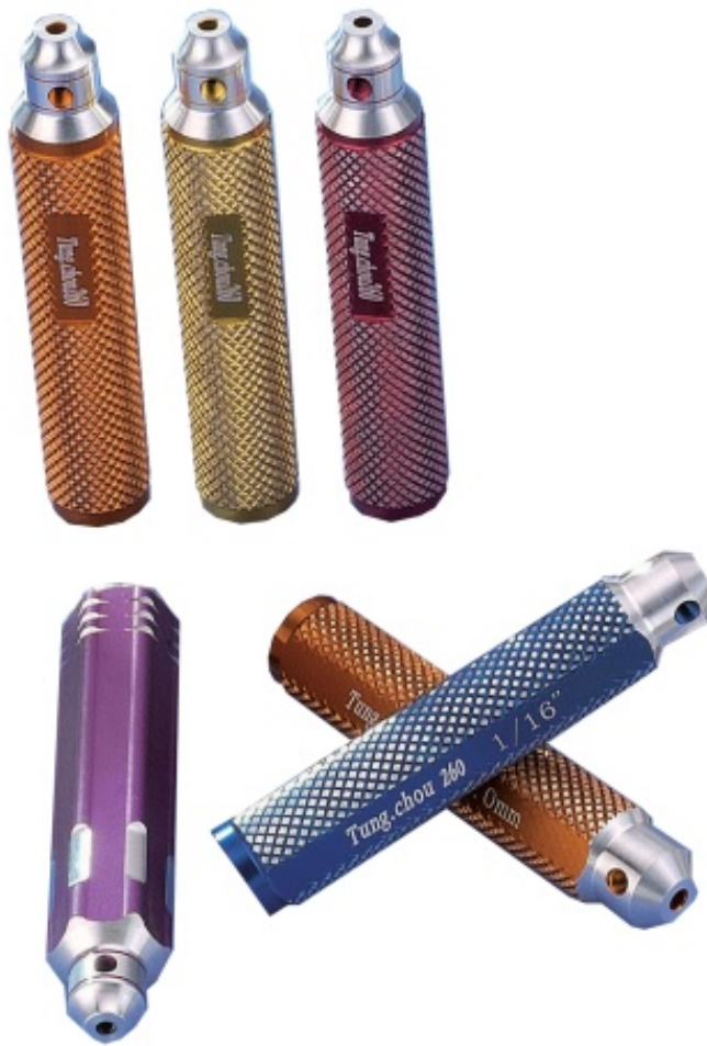
OEM/ Processing Service