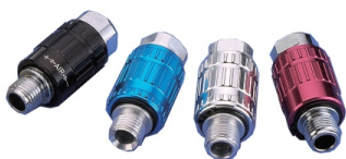
OEM/ Processing Service

TUNG CHOU INDUSTRIAL WORKSHOP is dedicated in Brass & Aluminum Products, Auto-Lathing, CNC Lathing Machines, New Design, OEM., OEM with operations in Taiwan.