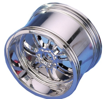
OEM/ Processing Service