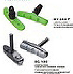
Disk Brake Pad