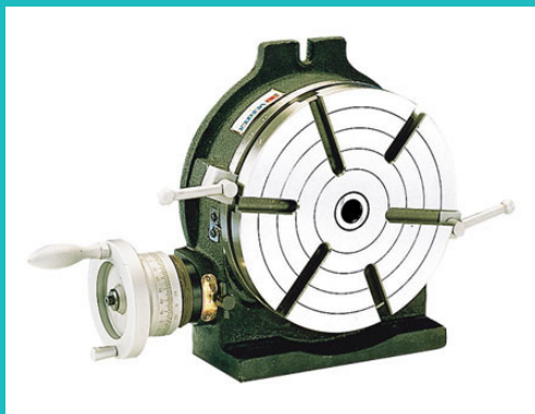
Vertex Horizontal, Vertical Rotary Table, HV-6, 8, 10, 12, 14, 16, WITH face plate