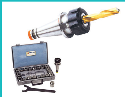
Collect Chuck Kit With ISO Taper Shank