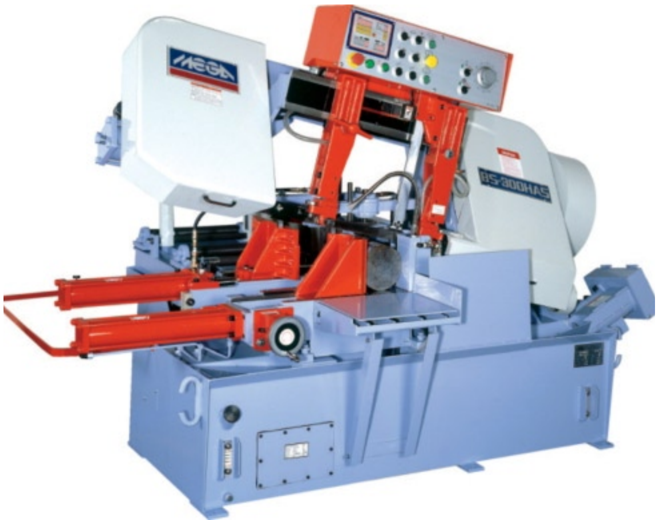
Automatic Horizontal Band saw