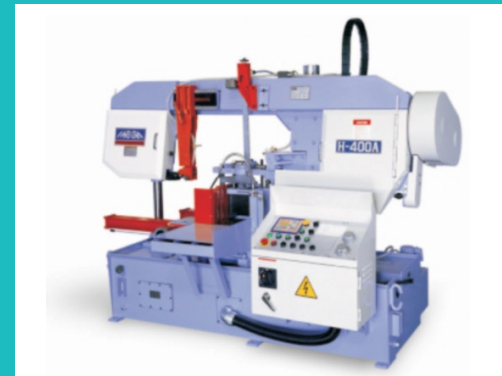
Double Column Heavy Duty Automatic Horizontal Band saws