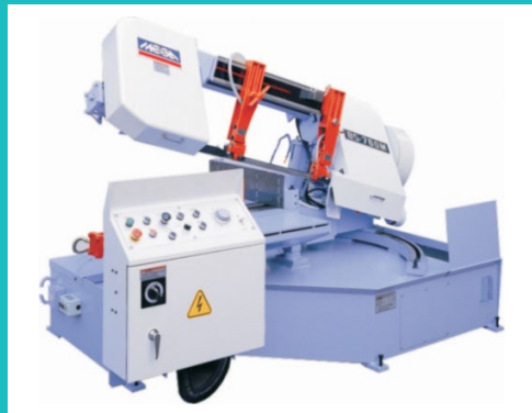
Semi-Auto Horizontal Band saw □ Power Turning Table Mitre Cutting