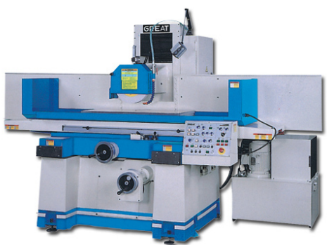
Auto Downfeed Precision Surface

CHUNG-WEI MACHINERY CO., LTD. is dedicated in "High-Precision Column Type Surface Grinder, High-Precision Surface Grinder, Vertical Rotary-Table Surface Grinder, Vertical Spindle Rotary-Table Surface Grinder, Vertical Spindle Surface Grinder" with operations in Taiwan.