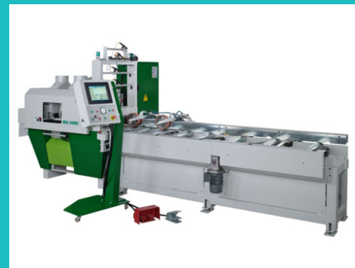
Movable Rip Saw