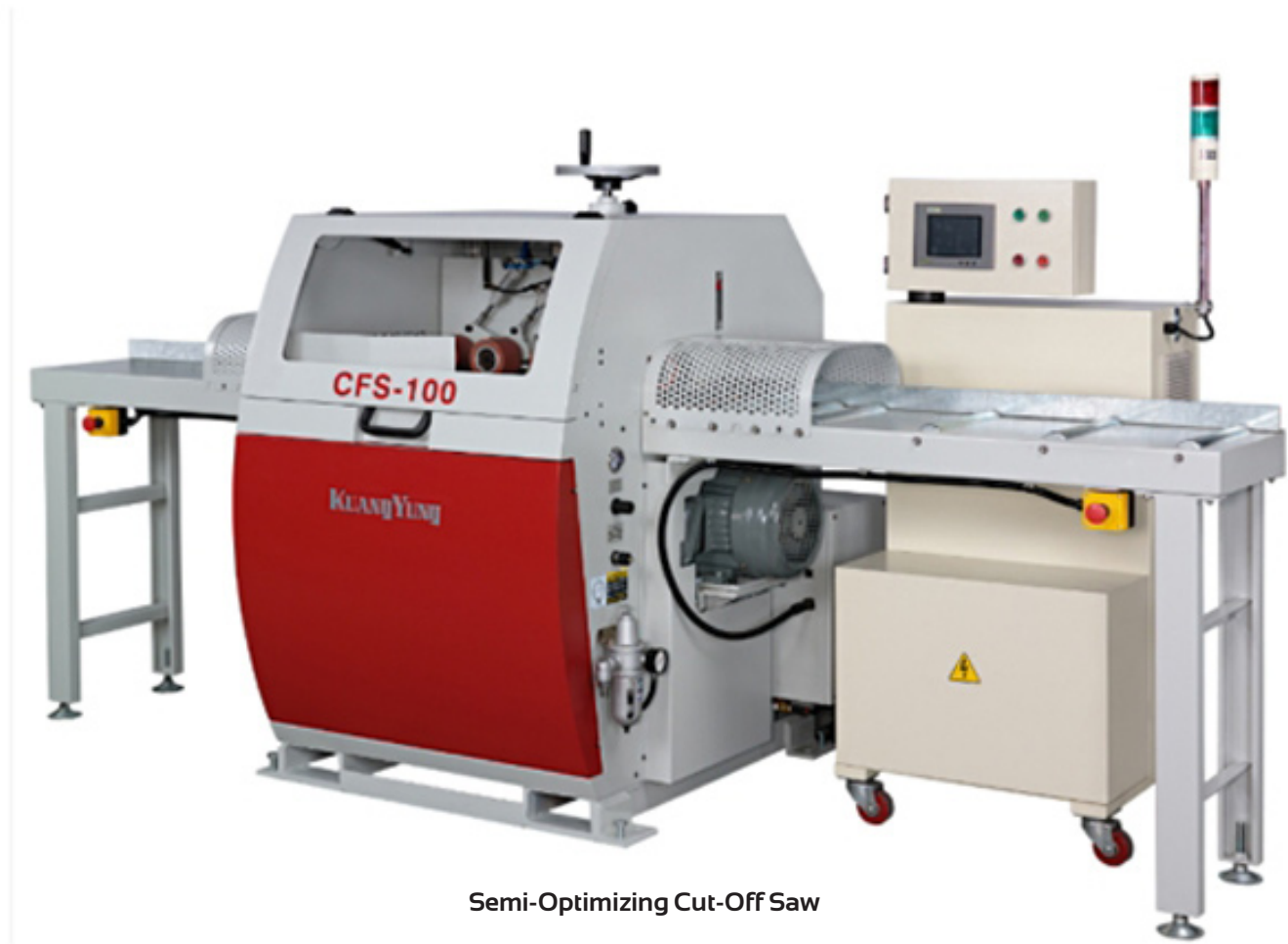
Semi-Optimizing Cut-Off Saw