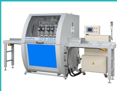
Semi-Optimizing Cut-Off Saw

KuangYung established in 1960 as the second company in Taiwan professionally manufacturing woodworking machine. Over these fifty years, we continuously devoted ourselves to the Rip Saw & Cross Cutting machines' research and development.