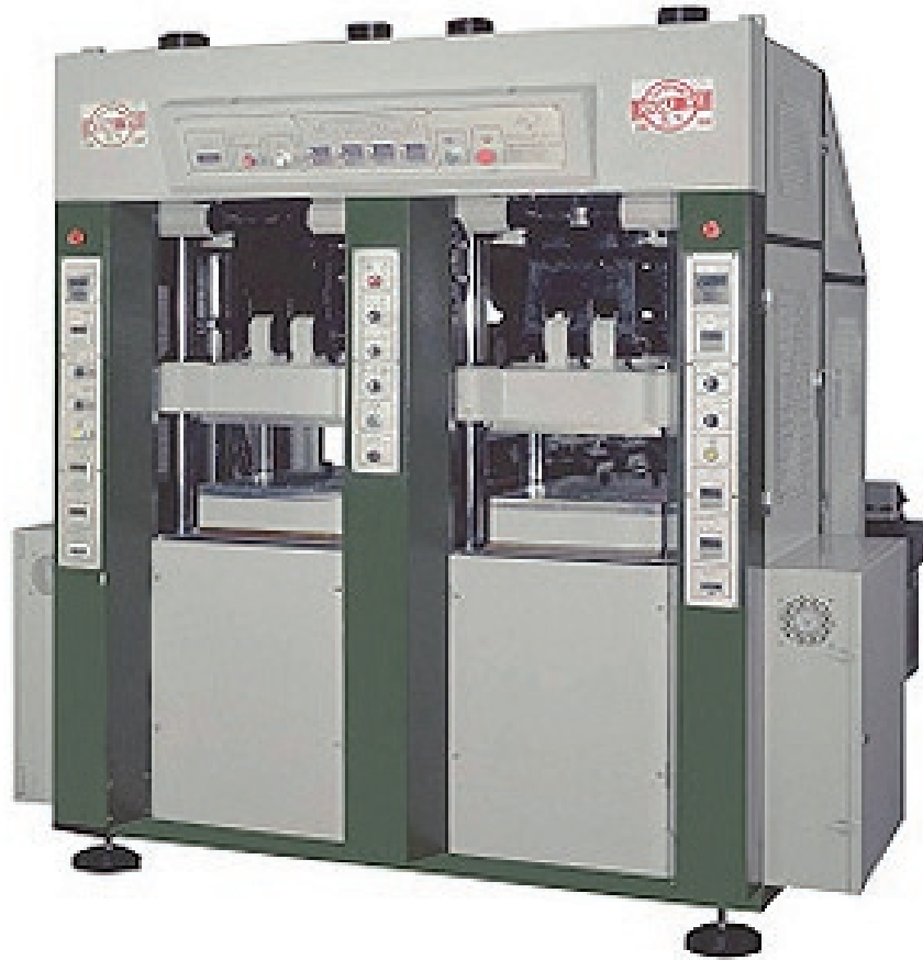
Vertical Plastic Injection Molding Machine