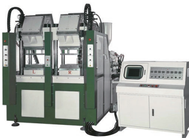
Two Color Vertical Type Automatic Plastic Injection Molding Machine

KOU YI was established by our founder, Mr. Wen Song Jiang, in 1959. At the beginning based on our years of experience in manufacturing mainly hydraulic extort oil machines to consolidate our well technique in design and manufacture hydraulic type machine later on.