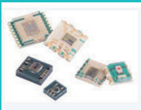
COB, Chip on Board Package

LINGSEN PRECISION INDUSTRIES, LTD. (LPI) was founded in 1970 by Mitsubishi Electric Corp. and Dahsen Electronic Industries, Ltd. as a joint venture in Taipei, Taiwan. In 1973, Lingsen was moved to Taichung Export Processing Zone (T.E.P.Z.) and reorganized as a wholly owned and independent sub-contract assembly company. Lingsen became a public company in 1998 and stock is traded in Taiwan Stock Exchange Market. The total floor space of headquarter