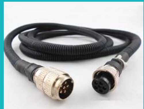
AUTOMOTIVE BMS CABLE