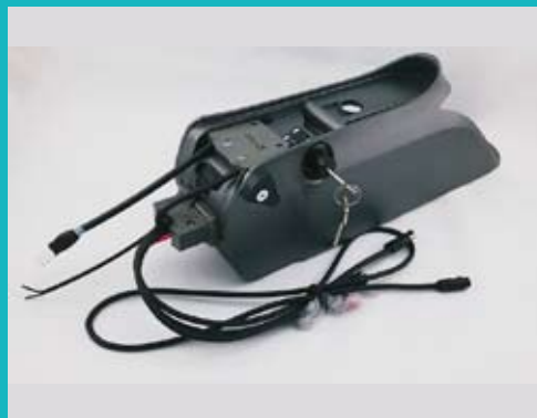
E-bike Battery Cable Assembly