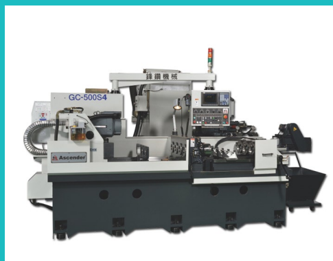
CNC Deep Hole Driling Machine