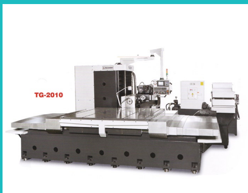
CNC Deep Hole Driling Machine

Set up in March 2012 with the commitment to enhance quality, techniques and service related to deep-hole machining that calls for precision manufacturing process, Ascender Machinery Inc. boasts a management team with ample experience and expertise in machine tool assembly, design, and deep-hole machining applications.