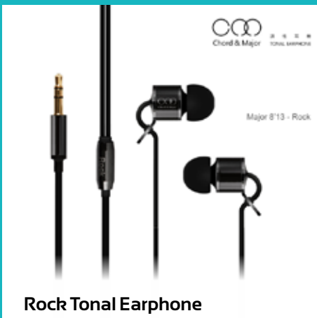
Rock Tonal Earphone

The ground-breaking TONAL EARPHONE is designed to optimize different musical genres and allow consumers to easily match their tastes with suitable earphones.