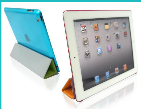
Ultra-light/-thin cover for iPad2

Though set up in 2010, Uniboo Technology has been in the field for 27 years with specialized design and production teams to develop PC peripherals and accessories as stylish mouse, ultra-light and thin cases/covers for smart phones, iPads etc., also partnering with American firms to design products to be made-in-Taiwan.