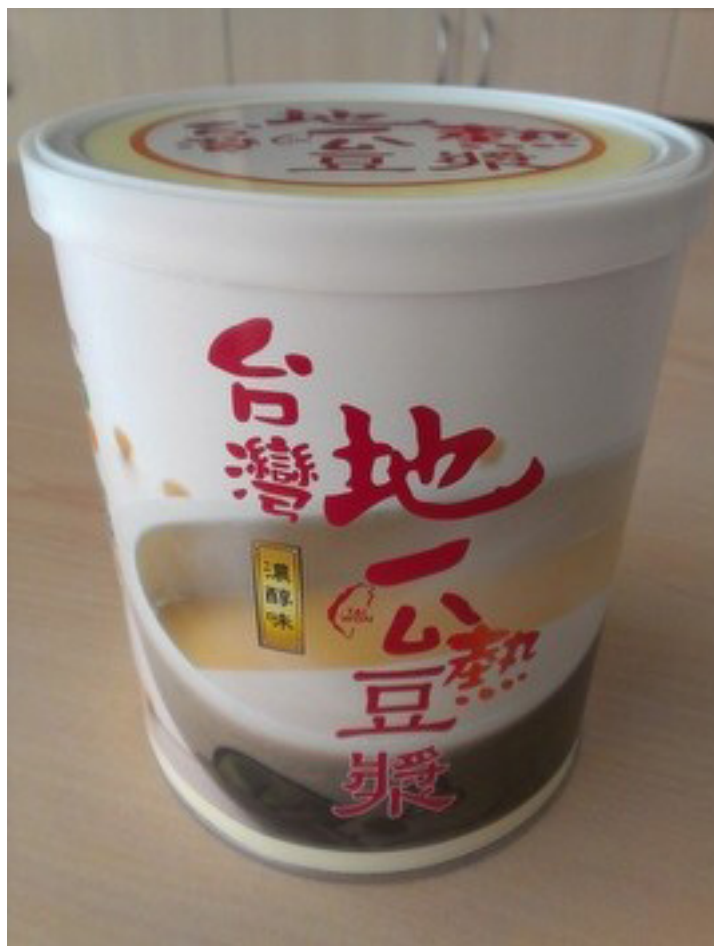
Yam & Soybean Powder