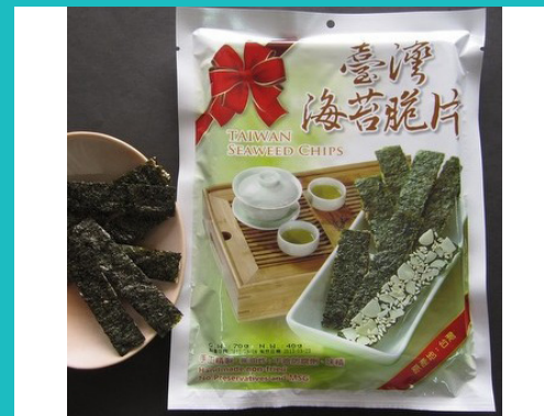
Almond-Flavored Seaweed Chips (also available with cushaw seed and wild buckwheat rhizome flavors)