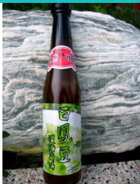
Sword Bean Stock

To enhance added value of farm produce, Taiwan Food Industrial focuses on farm-produce processing and develops diversified food products that create a new market for traditional industries. We have ample experience in developing sauces, stock, soup and powder, as well as assorted milk, rice and wheat powder formulas to fully meet demand.