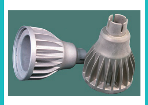
Car Lamp Housing