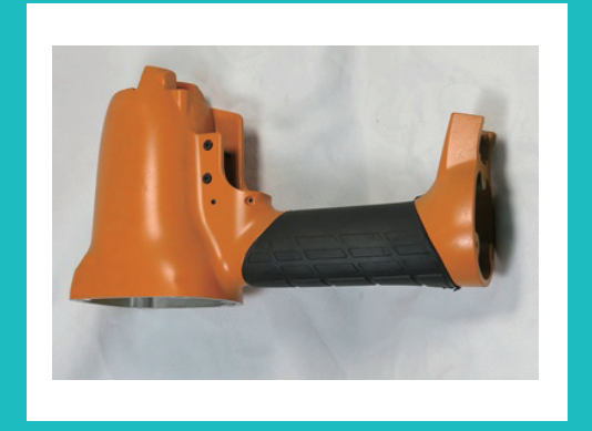
Mold Development and Molding of Auto Repair Tools