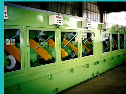
Pipe Making Machine