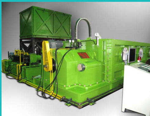
Pipe Making Machine