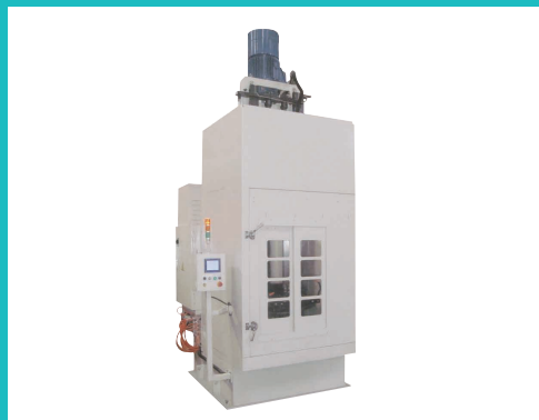
Table-up Broaching Machine