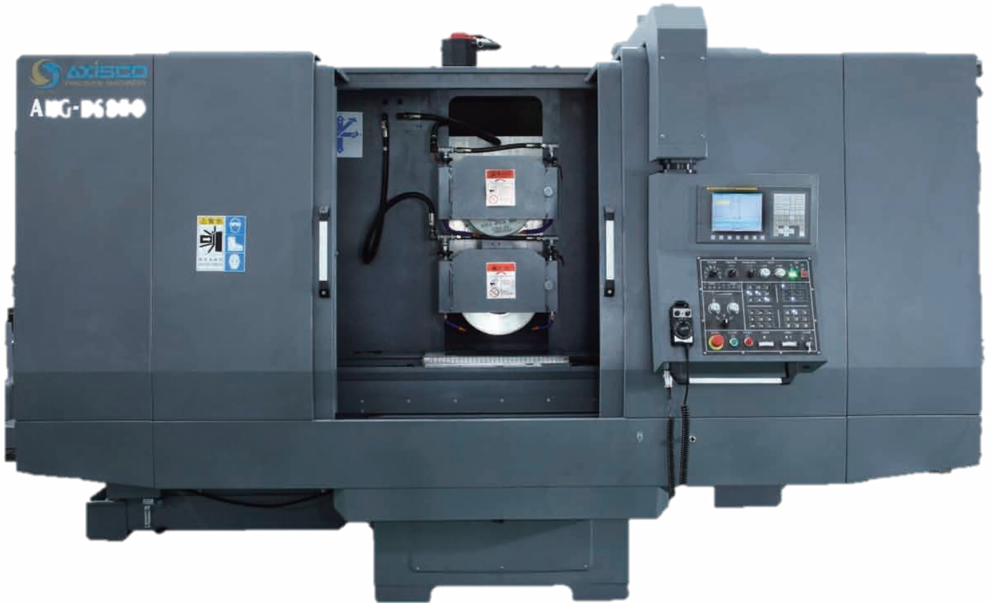
CNC Grinding Machine