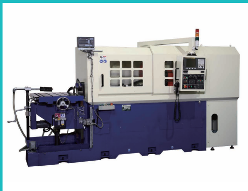
CYB-500 Horizontal Deep Hole Drilling Machine(Platform type)

Established in 1984, AXISCO PRECISION MACHINERY CO., LTD. specialized in metal secondary processing equipment. Various kinds of equipment can be custom-made from sphere finishing, milling, drilling, boring, reaming, tapping, cutting and broaching processing. The machine can be one purpose or multi-purpose and we have well experienced providing whole-plant project for industry of auto parts, door closer/hinge, ball valve, hand tools, hardware, in lock & electronics components.