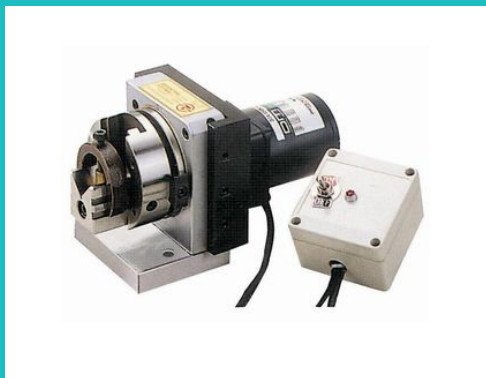
Fixed Speed Punch Former (Single Type)