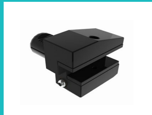
Radial Tool Holder Overhead form B4 Left Hand, short