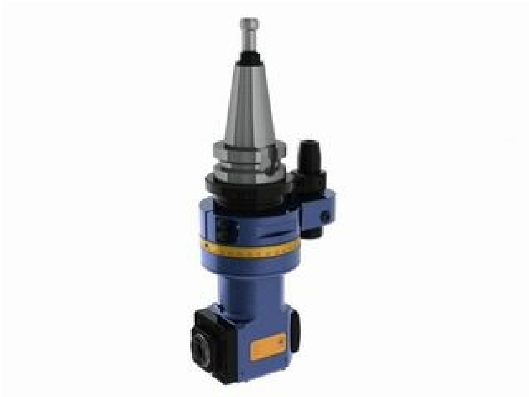
AHM (BT-ER) Aluminum Angle Head