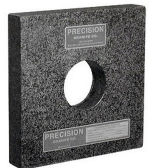
GRANITE MEASUREMENTS- Tetragonal Master