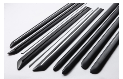
Body Protector Moldings