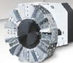
CLT-505~4505, CLT-63~300 電腦車床刀塔