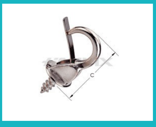
Safety Cup Hook