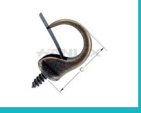
Safety Cup Hook