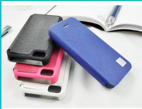
(Metal-Slim) Apple iPhone5C Classic U

Metal-Slim Corp. has been dedicated to the protective solution for smartphones since it was established in 2008. Its rich experiences, outstanding performance, advanced information & high quality are praised by customers worldwide. Metal-Slim with its professional team that provide accuracy, correct and efficient service to create high brand value in the industry.