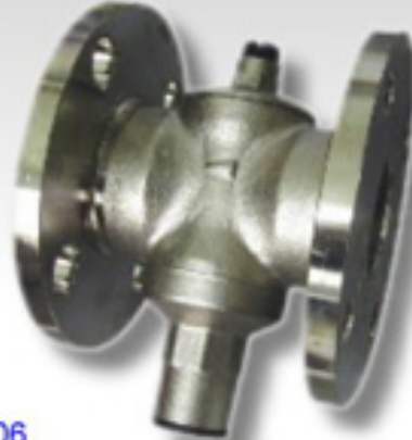
01-106 Flange Pressure Reducing Valve