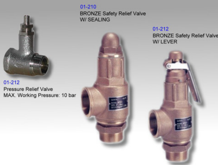
01-210 BRONZE Safety Relief Valve W/ SEALING

ALLBIZ ENTERPRISE serves Industrial Valves, Pipe Fittings, Hardware Accessories and OEM/ODM Products. Our product lines include Pressure Reducing Valve (PISTON, DIAPHRAGM), Automatic Air Vent, Safety Relief Valve, Pressure Relief Valve, Water Gauge Valve/Cock, Water Hammer Arrestor, Check Valve, Bronze / Brass Pipe Fittings and OEM products.