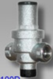
01-Y100D Pressure Reducing Valve for RO