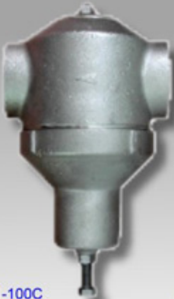
01-100C Pressure Reducing Valve SIZE: 2 1/2, 3", 4"