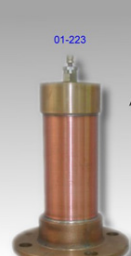
Companion Water Hammer Arrestor - FL STD: ANSI 150, JIS 10K, PN 16, others