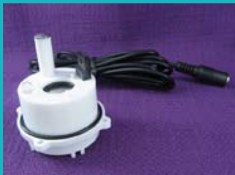
Thrown into Ultrasonic Nebulizer