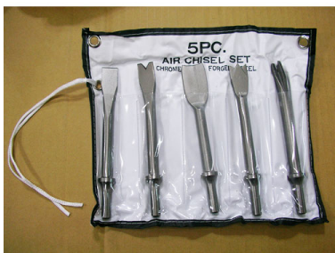
0.401" 5-pc Chisel Sets

Specializing in making pneumatic hammers, electric/pneumatic chisels, we use materials as hot-forged 40ACR and SCM440 which are strictly process controlled. We guarantee to supply best-quality products, and welcome samples and charts for counter-production.