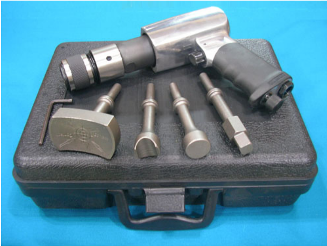
Auto Chassis Repair Tool Kits