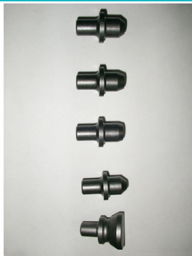
0.401" 1X Rivet Sets