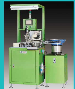
Oil Seal, Spring Loading Machine