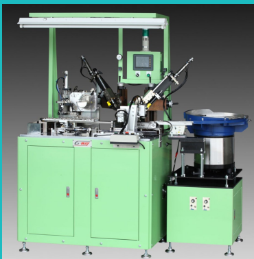
Oil Seal Trimming & Spring Loading Machine

We offer a wide array of processing equipment for seal makers, including visual detection systems, oil-seal spring-fitting machines and vacuum forming machines, among others. Being a leader having frequently revolutionized technology in turnkey seal-production plants, we have a sound technical support system to help customers produce seal kits with high cost-efficiency. Every machine from G-WAY is guaranteed to turn out top quality items