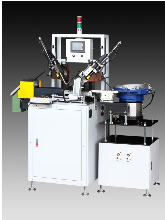
Fully Automatic Vacuum Type Oil Seal Trimming Machine