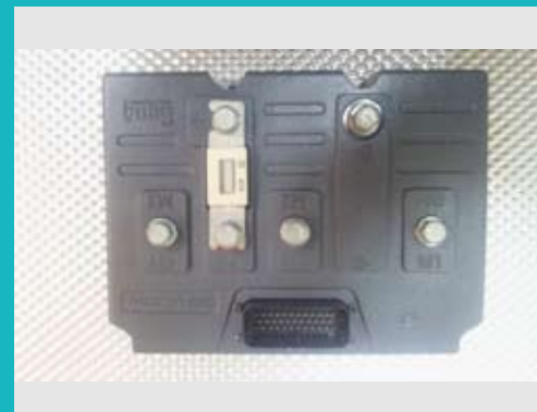
AC Motor Controller