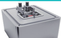
Blood vessels fixed with fixture

Set up in 2006, Genemessenger Scientific has built sound relationships with customers for being creative, aggressive and ample experience in R&D, sales and industry-government-academia collaboration related to biomedical supplies, instruments, facilities over the past years, but has diversified into biotech and cosmetic medicine R&D to cope with competition and steadily grow.