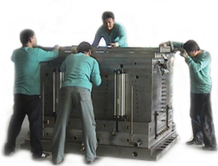
PLASTIC INJECTOR MOLDS