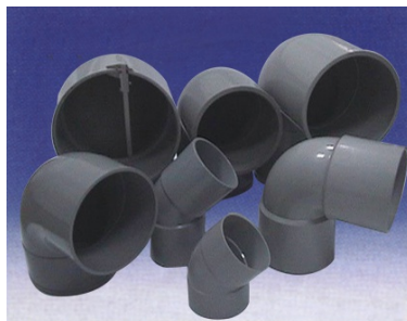
PLASTIC INJECTOR MOLDS