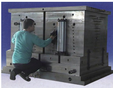
PLASTIC INJECTOR MOLDS

With more than four decades of experiences in marking sophisticated molds , POWER LAND CO., LTD. Specialize in plastic injection mold design and manufacture to provide high-quality mold products in tandem with prompt services to meet the special requirements of customers form around the world . The ISO9002-certified manufacturer has expertise t ... [more]