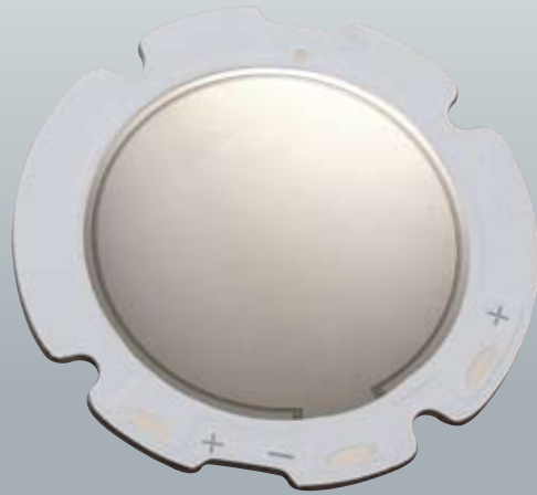
Mirror-Surface Aluminum Substrate