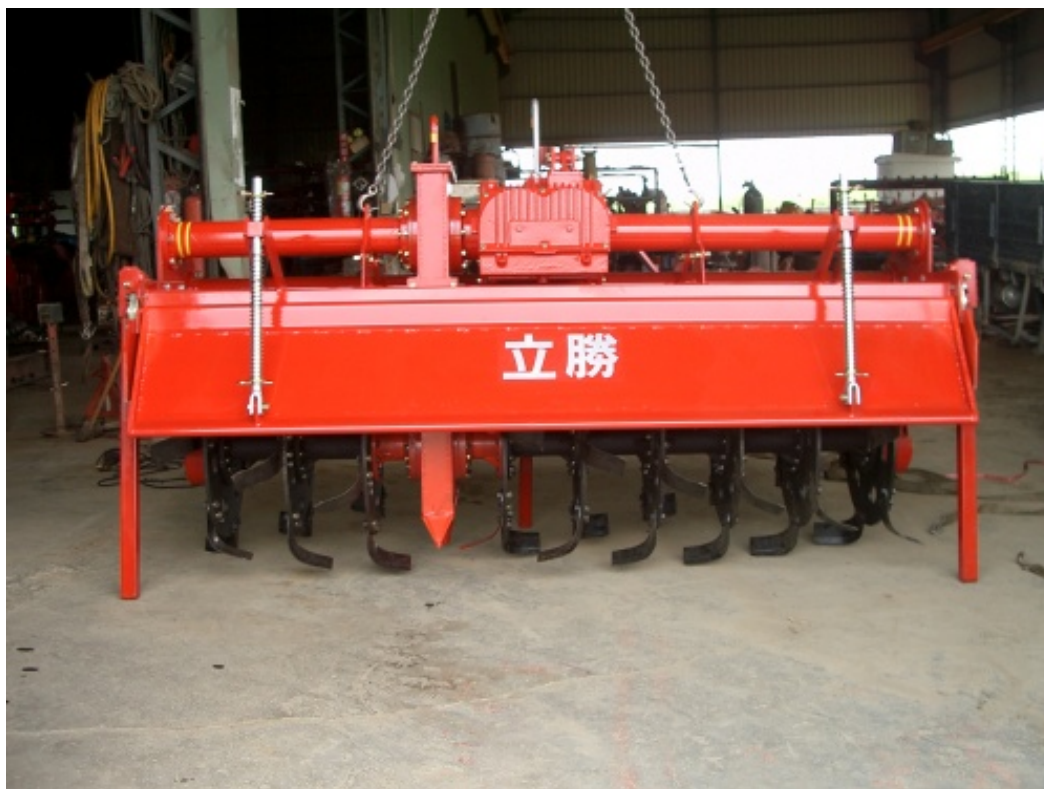
Deep-Digging Rotary Harrow