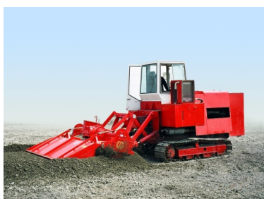
Deep-digging Rotary Harrow