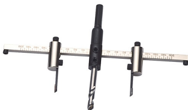
Dual-blade Tungsten-carbide Hole Cutter(diameter: 40-200mm)/Ratchet

Established in 1978, our company has been specialized in the manufacture of hand drills for woodworking uses, adjustable round-hole cutter, and multi-functional hand drills. Please contact us for more information.