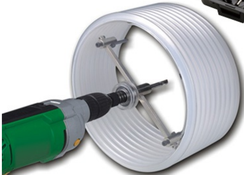
Dual-blade Tungsten-carbide Hole Cutter W/Retractable Dust-collector/Ratchet Brace/Cutting Tools