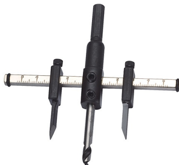
Ratchet Brace/Cutting Tools/Electrician's Tools/Building