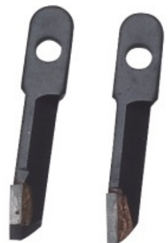
Dual Tungsten-carbide Blades