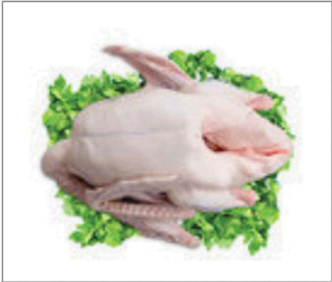
Meat of goose, whole