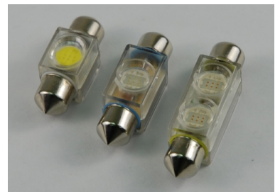
Festoon LED Bulb