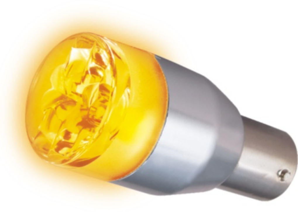
CAR Turn Signal/ Brake LED Bulbs