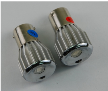
CAR Turn Signal/ Brake LED Bulbs

Started manufacturing various lighting bulbs in Taiwan in 1984. And, dedicated itself to LED BULBS for car and household use in 1993. Our factory is certified by ISO 9001, which assures you of good quality. We have the area of 10,000 square meters, 30 production lines, with the monthly capacity of 10,000,000 bulbs. ACL Super Bright is committed t ... [more]