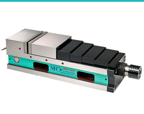
MC Hydraulic Angle Lock Vise

established in 1991, We specialize in manufacturing Precision Machine Vise, Hydraulic Vise, Drill Re-Sharpening Machine and Machine Tool Accessories.