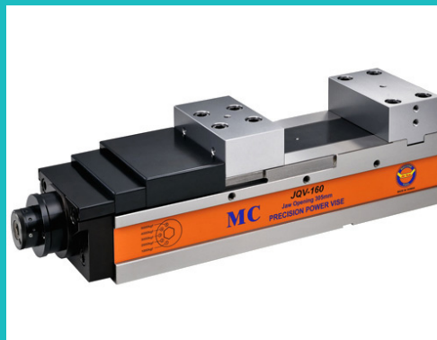
MC Power Vise