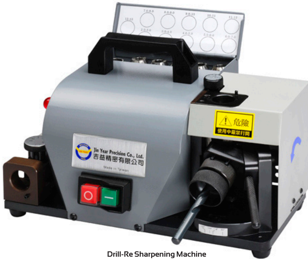
Drill-Re Sharpening Machine