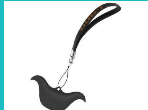
Water Chestnut Flash Drive