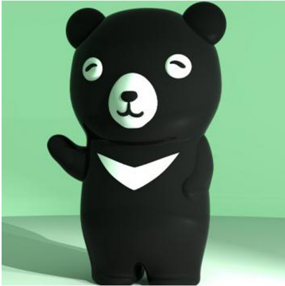
Formosan Black Bear