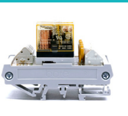
Signal Converting Module

Due to the disadvantages which traditional wiring methods not only caused time, labor, and wire costs, but also increase the expenditure; hence, bore believes introducing newly wiring design will solve and improve these problems.