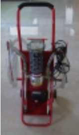
Oil Filter (molf 5)

Founded in 1999, COOLBIT produces mainly air-to-water heat exchangers widely used in solar-powered generators, engineering vehicles and industrial equipment as hydraulic systems, as well as aluminum finned heat exchangers. Differing from conventional counterparts that are effective only with lower-HP hydraulic systems, our air-to-water coolers are developed with modern technologies to prove relatively more efficient.