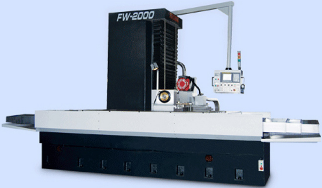
Horizontal Deep Hole Drilling Machine