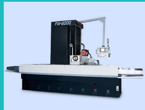
Horizontal Deep Hole Drilling Machine