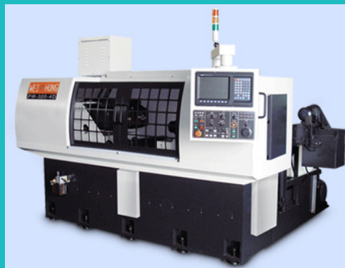
Horizontal Deep Hole Drilling Machine