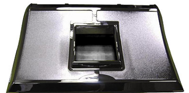
Front Door of Aluminum Die Casting