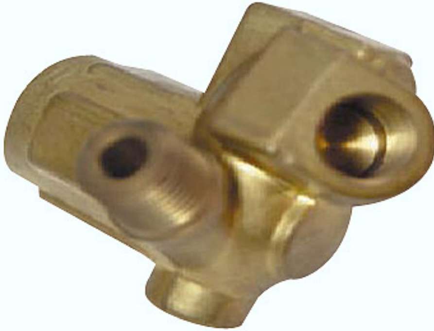
3 Port Valve of CNC Turning Parts