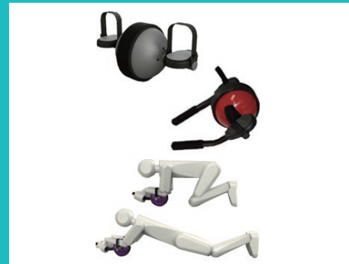
PS607 AB ROLLER