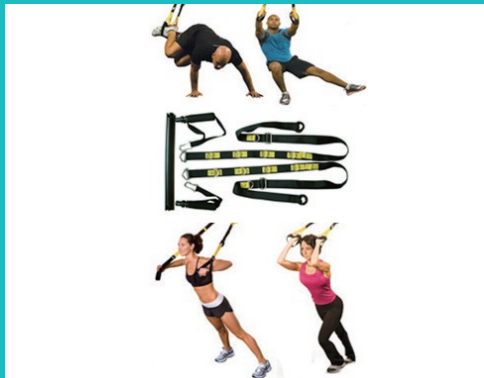
EX365 SUSPENSION EXERCISE SETS