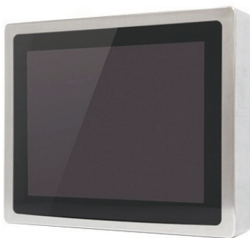
Waterproof stainless-steel multifunctional industrial panel PC

A designer and maker of industrial PCs established in 2004, Aplex Technology consistently focuses on R&D to fully meet market trends and maintain always a step ahead of peers, providing diversified competitive solutions as hardware platforms for system integration applications, including embedded computing platforms, human-machine interfaces, industrial displays etc.