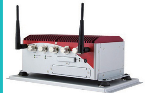
EN50155 Box PC for railway vehicle