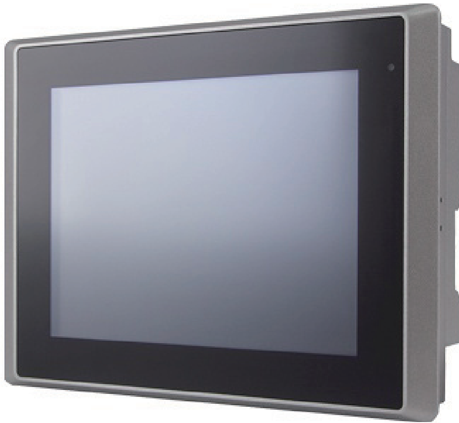
8" Fan-less basic industrial human-machine interface